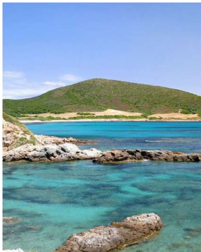
Plage de Tamarone - Tamarone beach

The wild beach of Aliso (35 kilometres from the hotel) is to be found on the east coast of the Cap Corse. It is located in the town of Morsiglia , and as not very many people go there, it stands out as a most pleasant spot. Remember to stay near the shore on days of strong winds and rough sea, as the sea streams are a potential danger. Meals are available from the paillotte on the beach. To drive there from the hotel, reach Aliso by heading north along the D80 up to the town of Luri , approximately 16km away.