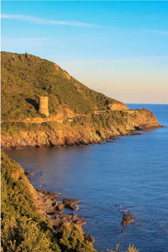
Tour Génoise de l'Osse - Genoese tower of Osse

North from Erbalunga , on the D80 road, you will cross Sisco's seascape, you can also visit its picturesque village/hamlet ( see hiking p.68 ). After the beach of Ampuglia ( see beach p.49 ), also known as Marine de Pietracorbara , you will see the Genoese tower of Osse ; its name supposedly comes from the bones buried at its base. Dating from the 17 th century, it is in perfect state of conservation. Below is the lovely wild crick of Osse, the ideal place for a swim.