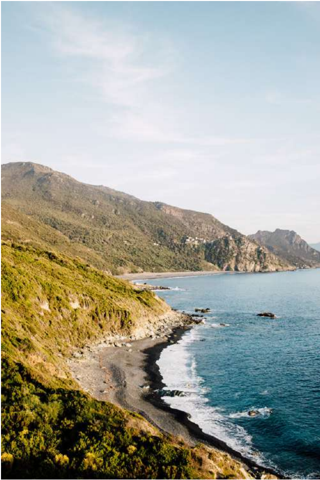
Plage de Nonza - Nonza beach