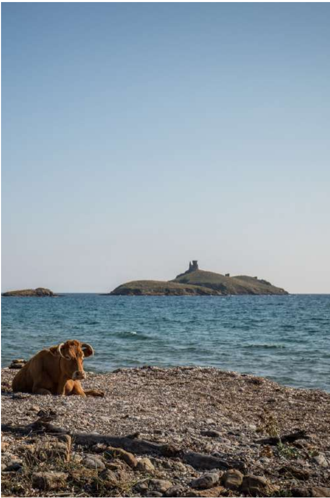
Plage, Sentier des Douaniers - Beach, Sentier des Douaniers