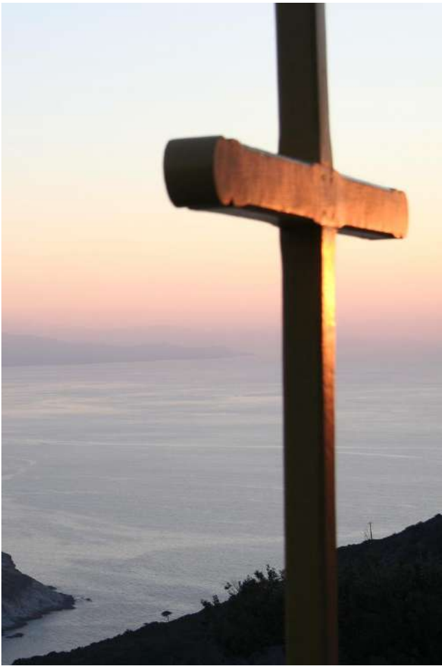
Quelque part à Barrettali - Somewhere in Barrettali